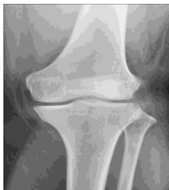
Fig.6. Anisotropic filtered image

In this stage, the anisotropic diffusion filter and Gaussian filter is used to remove the noise. Where, anisotropic diffusion which is also called as Perona–Malik diffusion is a method used to reduce noise without affecting important parts of the image contents like edges, lines or other details that are significant for the analysis of the image. The resulting image of this method is obtained by a convolution of the input image and a 2D-isotropic Gaussian filter, which increases the width of the filter along with the parameter. The resultant images are as shown below: