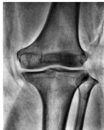
Fig.8 Output of Morphological operations

pixels. By considering the size and shape of the neighbor pixel, we can construct morphological operation as per required specific shapes and size in the input image. In this paper, Dilation and erosion morphological operations are implemented. Where dilation is used to add pixels to the boundaries of objects and erosion is used to remove pixels on the boundaries object in the input image. Also in some cases, a combination of dilation and erosion is used in specific image preprocessing techniques to fill holes or remove small objects in the image.