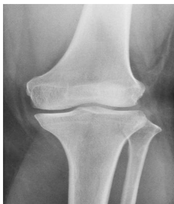
Fig.5.RGB to Gray Converted