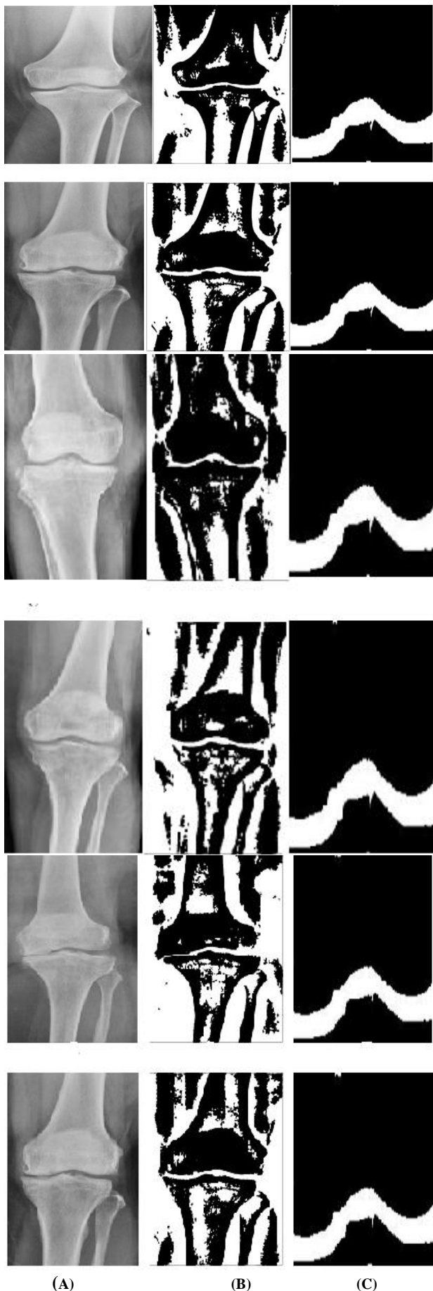
Fig 12: A- Input Image, B- Segmented Image and C- Resultant Image