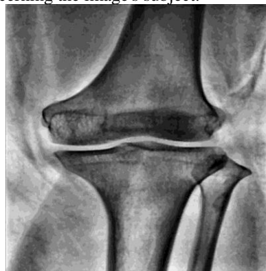
Fig.9.Sharpen Image using unsharp masking

In this stage, to highlight the edges of specific regions in the image, we have implemented unsharp masking (USM). In image processing, USM is an image sharpening technique which is used to sharpen the required region in a digital image. The "unsharp" is the name/code used to create a mask of the original blurred or negative image. Then the unsharp masked image is combined with the original (positive) image to create a comparatively less blurry image than the original. Even though the resultant image is clearer it may be less accurate concerning the image's subject.