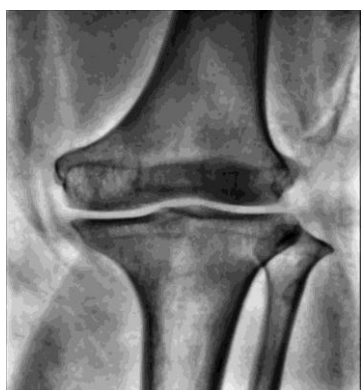
Fig.7.Gaussian Filtered image