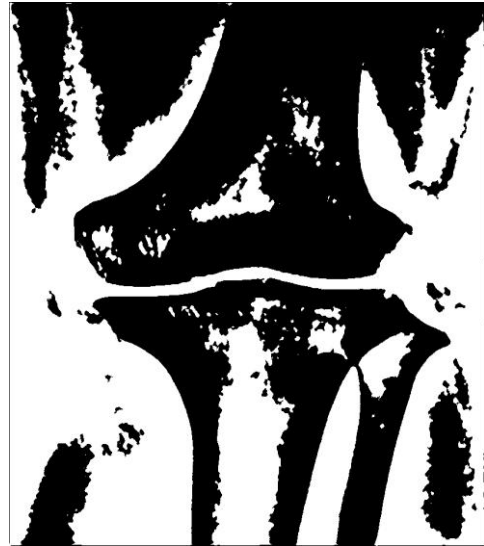
Fig.10: (a) Segmented images using PSO

Where, g(x, y) represents threshold image pixel at (x, y) and f(x, y) represents grayscale image pixel at (x, y) [14].