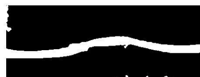
Fig 11. Cropped Region

Once the segmentation is done using PSO algorithm, the OA knee region is highlighted and extracted with the help of thresholding. By using trial and error method outer border of the region is defined in the process, once the segmentation is done the region is cropped automatically. The required region is automatically cropped by setting the default region. Then finally measuring the distance between the articular surface the thickness of the cartilage is measured.