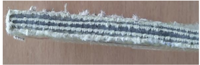
Fig. 1. Hybrid laminate reinforced with K49 and basalt fibers