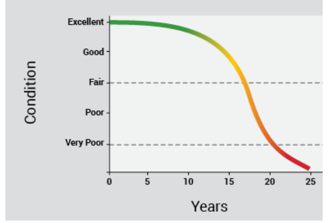
Fig. 1 The building condition level over the life cycle

It will classify the building into its condition level based on the index value. The highest point in building condition is 95 and lower is 35. The acceptable level of condition for the building is good which is indexed to 75.