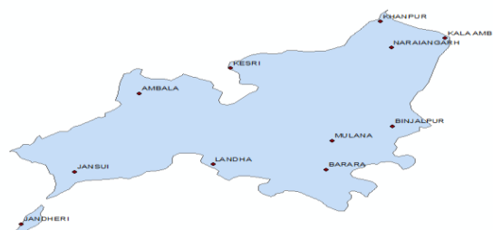
FIG: 1 ADDING PARAMETERS TO THE GRAPH

Now add all the parameters to the Lat-long chart such as carbonate , bicarbonate , sodium , chlorine , ph , calcium