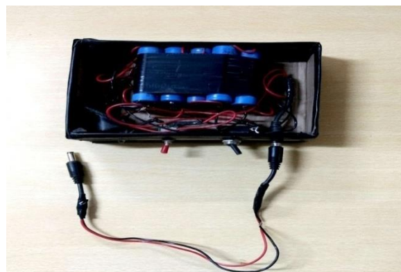
Figure 5: Demo setup of Universal power holder