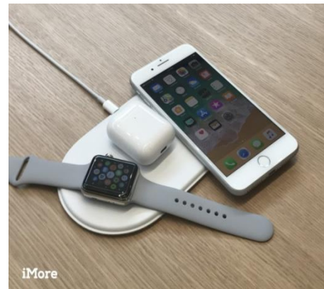
Figure 2: Wireless charger

Electromagnetic induction is used in wireless charger to charge the battery.