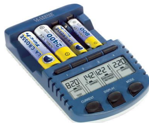
Figure 3: Example of double A and triple A batteries

This battery will maintain the temperature, voltage and the current source. The intelligent batteries are charged as much as fast upto 85% and then it will switch to tickle charging state. This charger will have maximum capacity to store the energy for many hours.