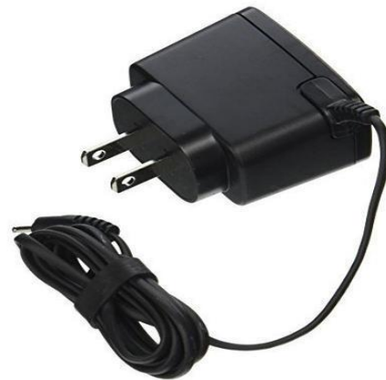
Figure 1: Basic mobile charger

Constant Direct current source or the pulsated current direct source is used to charge the basic chargers. The basic charger may be depends either on charging time or battery charge may not alter the output of the charger. The basic chargers are generally not expansive but this charger may have tradeoffs. Usually this type of chargers requires more time to charge the battery since these batteries are at safer charging speed. If the charger is overheated the basic charger will be damaged. The constant current source or the constant voltage source is supplied to the basic charger.