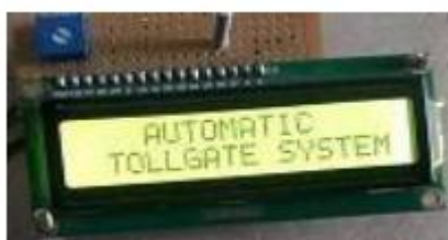
Fig. 5 validated image

The results are shown in the following Figures: