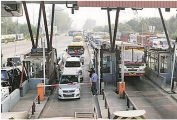
Fig. 2 Manual Toll Collection System