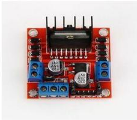
Fig. 4 Motor Driver