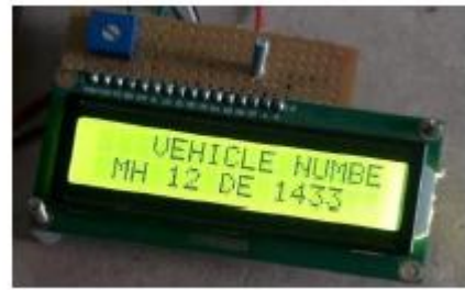
Fig. 6 vehicle number is detected