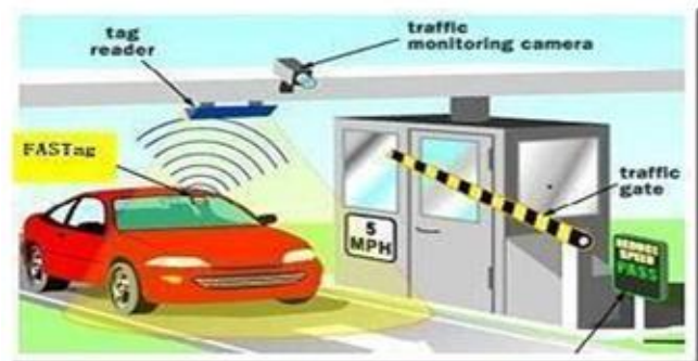
Fig. 1 RFID Based Toll Collection System.

The RFID tag consists of an integrated chip attached to an antenna, which contained the information stored electronically. The RFID reader is a component which is used to collect the information from an RFID tag. The data from the tag to the reader are transmitted by the radio waves. RFID Toll Collection System is shown in Fig. 1.