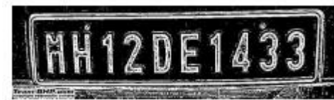
Fig. 8 Segmentation image