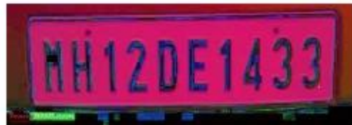
Fig. 7 HSC Colour image of license plate